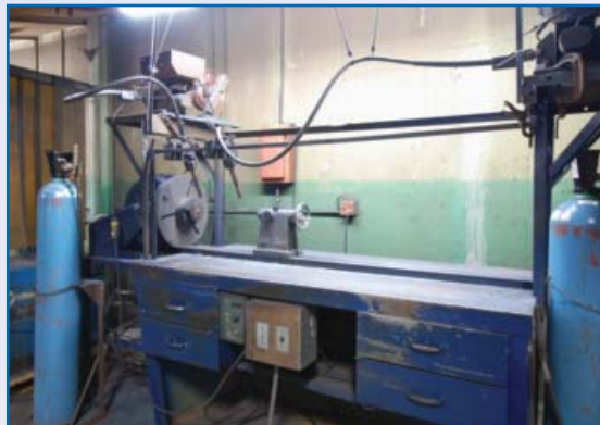
UNIQUE 18" Rotary Positioner W/Seam Weld