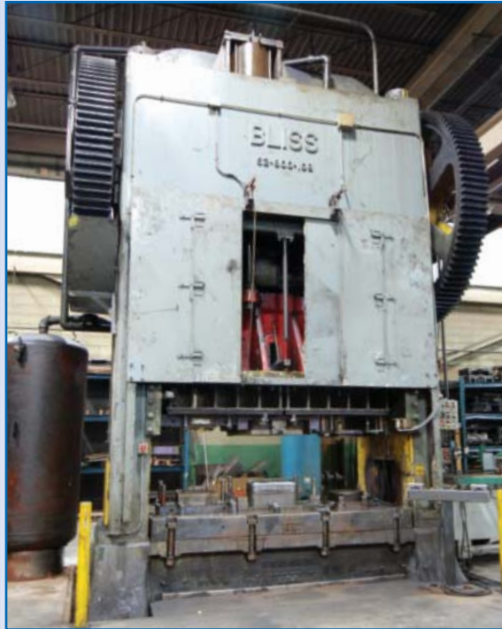
BLISS S2-800-106 Straight Side Press