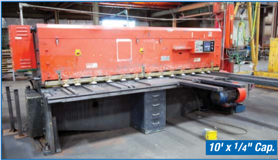
AMADA M3060 Squaring Shear