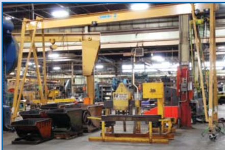
View Of Factory Equipment