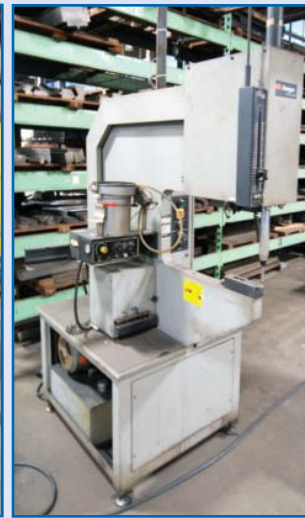
HAEGER 824 Insertion Press