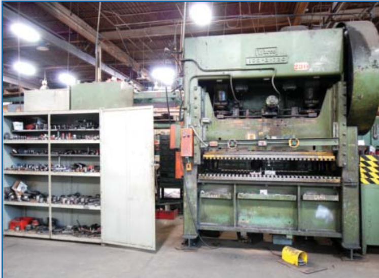
WARCO 100-2-72C Straight Side Press, WHISTLER Adjustable Punch Die Tooling