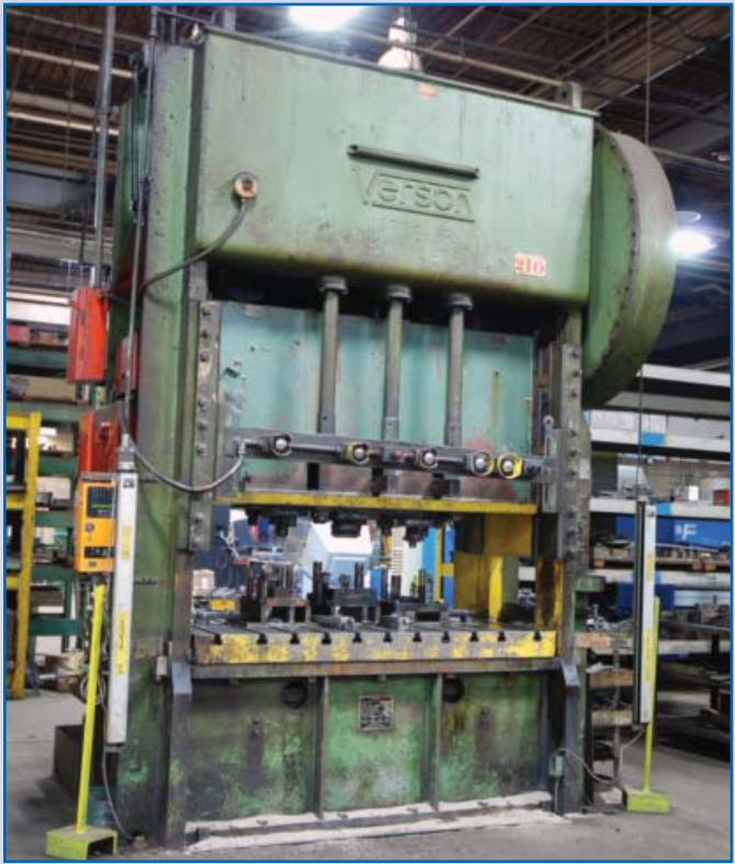
VERSON 772-SP 180 Ton, Straight Side Press