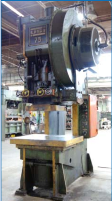
USI CLEARING 75 Ton A/C OBI Press