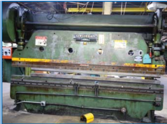
CINCINNATI No.5 Press Brake, 135 Ton x 12' Overall