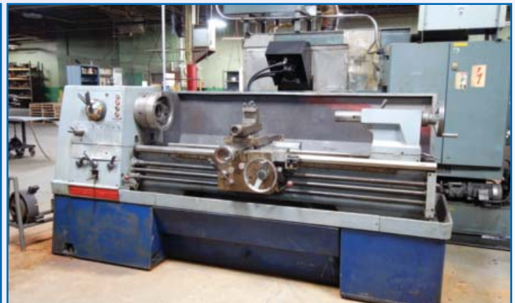
COLCHESTER MASTIFF 1400 Lathe

HEM H105A Automatic Horizontal Bandsaw, s/n 483996 w/7.5 HP, 14" x 14" Capacity