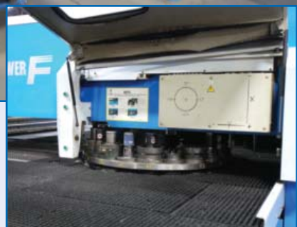
View Of FINN Turret