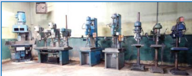
WILTON Lead Screw Multi-Tap Machines, SOLBERGA 4 Head Drill Unit, And Drills

HAMILTON 4019 1000 Ton Straight Side Press, 19-3/4 Shut Height, 14" Stroke, 6" Adj., 40" x 54" Bed, w/6" T-Slot Bolster