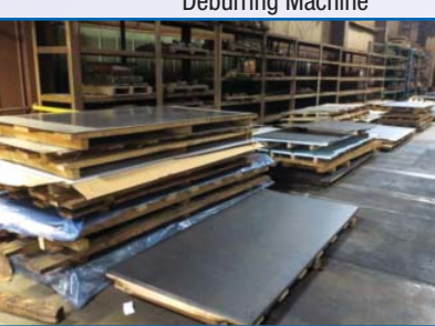
View Of Raw Material & Steel Inventory

(2) WORTHINGTON 100 HP Air Compressor, Tanks