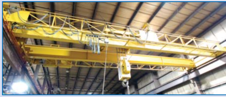
ZENAR 20 Ton x 50' Crane