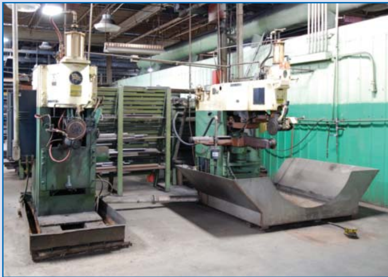
BANNER AND TAYLOR WINFIELD Rotary Seam Welders

TAYLOR WINFIELD MSUB-36-UKD 100 KVA Pedestal Type Rotary Seam Welder, s/n 50527, 36" Throat