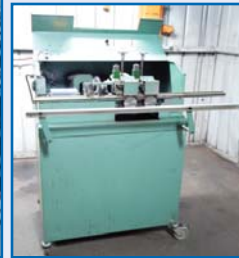
FALLS PRODUCTS 121 Deburring Machine