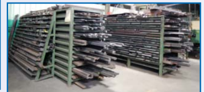
View Of Press Brake Dies