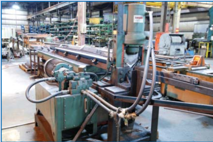
WHITNEY 609 Hydraulic Angle Iron Shear