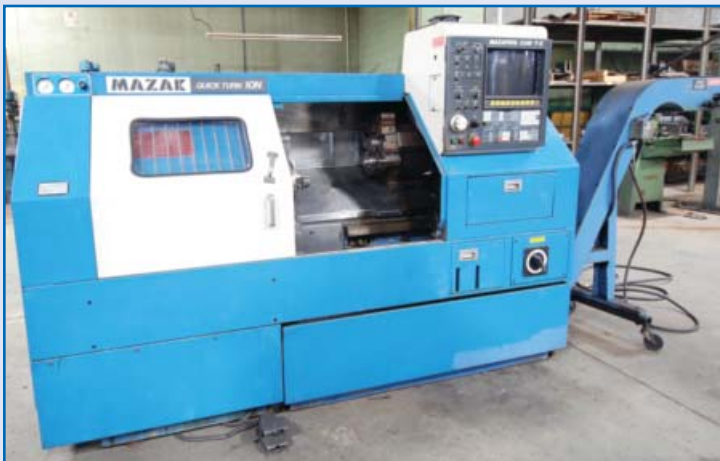
MAZAK QUICKTURN 10N CNC Lathe