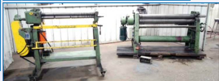
View Of ROUND0 & WYSONG Plate Rolls