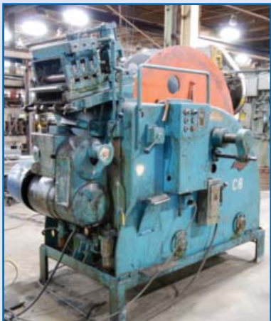
LITTELL CC60 Coil Cradle 312 Straightener