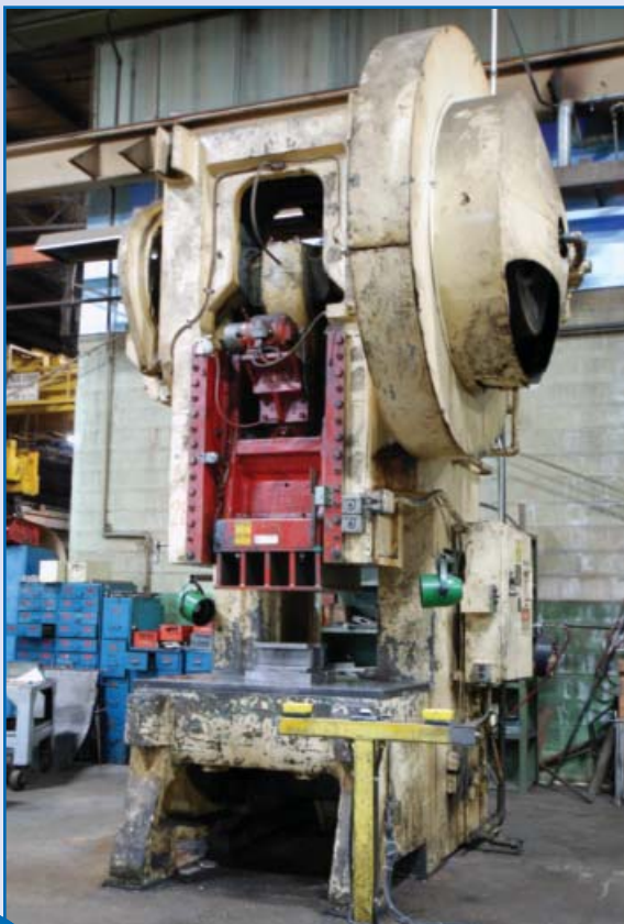
BLISS #30, 200 Ton Gap Press