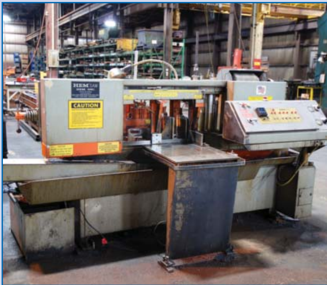
HEM H105A Automatic Horizontal Bandsaw