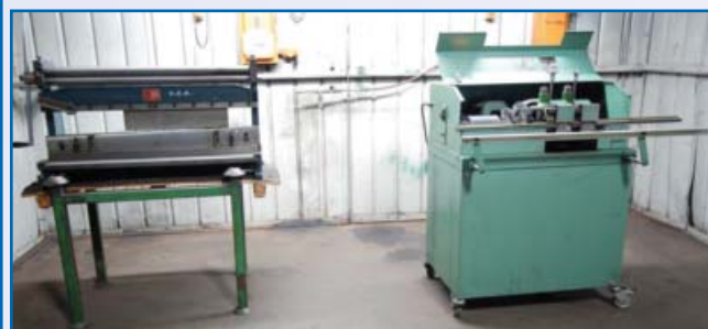
View Of COMBINATION Brake/Roll And Deburring Machine