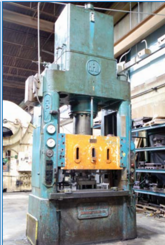
H.P.M. CU-Z 250 Ton Hydraulic Fast Traverse Draw Press

HAMILTON 1000 Ton Straight Side Press, 54" x 124" Bed, s/n n/a, 878, LINK LOGIC Brake Monitor, Light Curtain