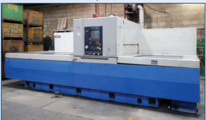
MAZAK LASER PATH TURBO X 48 CNC Laser