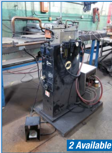
MILLER SSW-2040 ATT. 20KVA Press Type Resistance Spot Welder