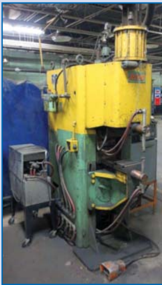
ACRO APPA 2-12, 200 KVA Press Type Spot Welder