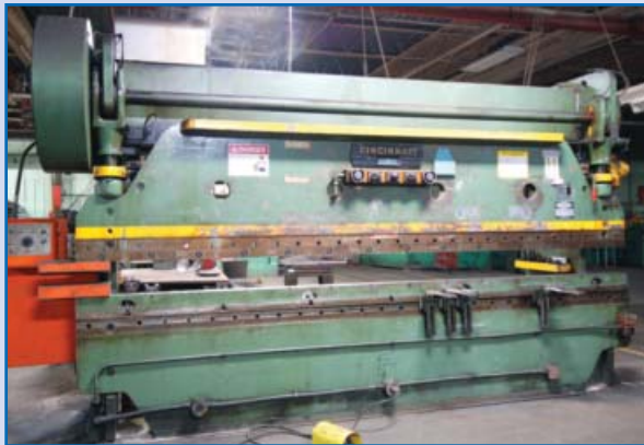
CINCINNATI No.5 Press Brake, 135 Ton x 14' Overall

BLANCHARD 18-30 Rotary Surface Grinder, s/n 3845 w/30" Dia. Wheel, 18" Segmented Grind Stone, 36" Swing