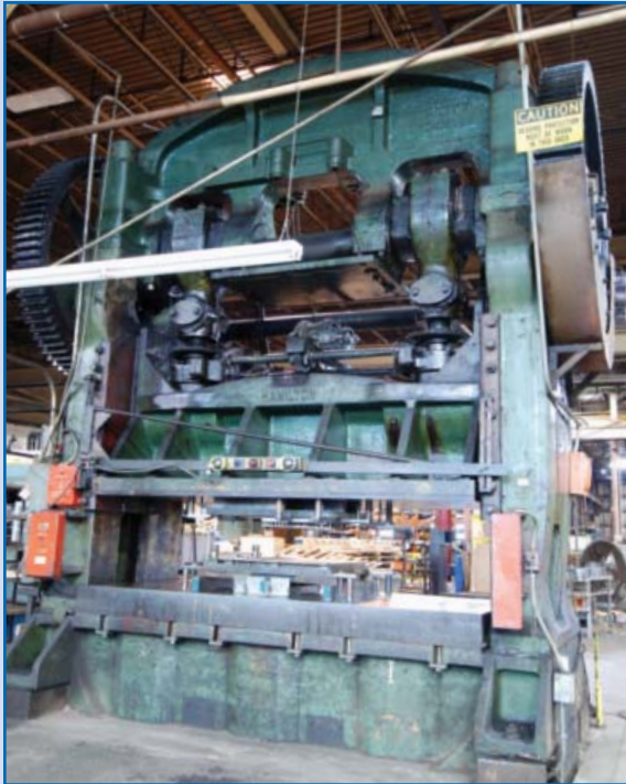
HAMILTON 4019 1000 Ton Straight Side Press