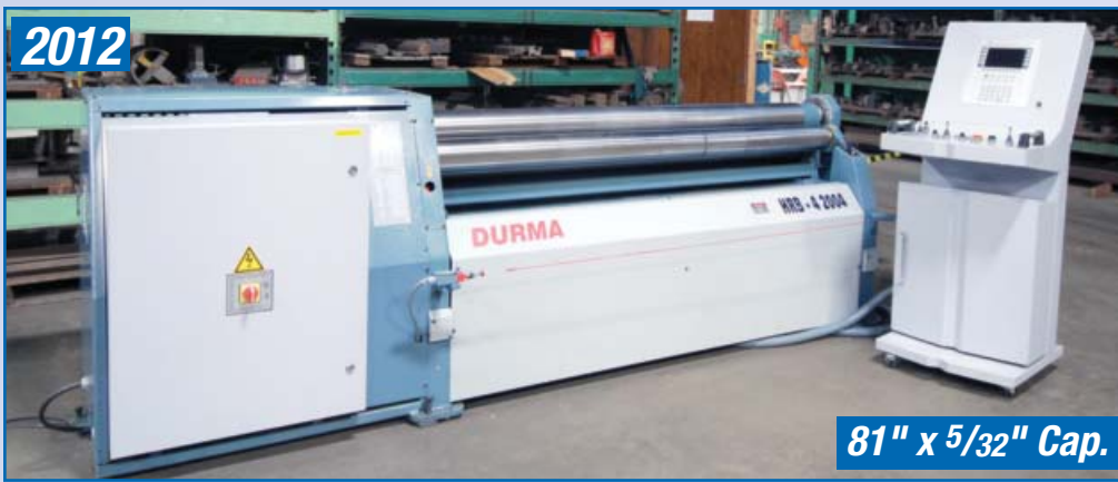
DURMAZLAR HRB-4M, 2004 CNC Plate Rolls