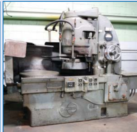
BLANCHARD 18-30 Rotary Surface Grinder