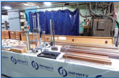
Large Quantity Of Inspection Equipment