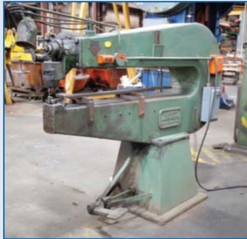
LIEBERT 1060 Circle Shear