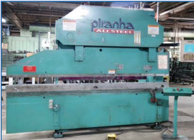
PIRANHA/ALLSTEEL 65 Ton x 8' Press Brake