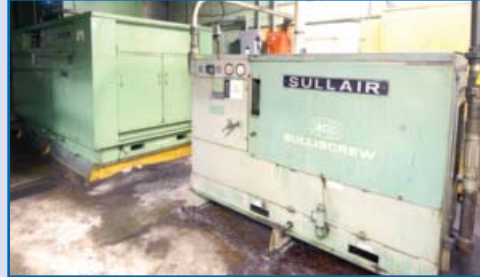
View Of Compressors