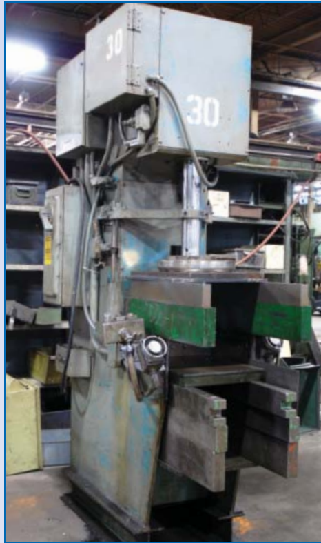
HANNIFIN F101-22X-PRX3, 10 Ton Hydraulic Press