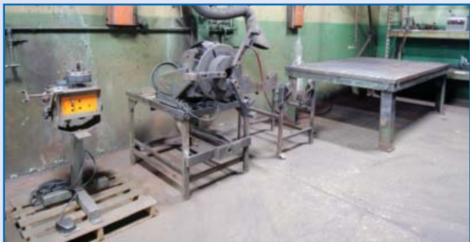
UNIQUE 18" Turning Rolls Rotary Positioner W/Seam Weld WELDSALE 4' x 8' Acorn Table

This brochure is meant merely as a guide. Infinity Asset Solutions makes no guarantee, expressed or implied, as to the accuracy of the information in this brochure. Buyers should inspect the goods beforehand to satisfy themselves.