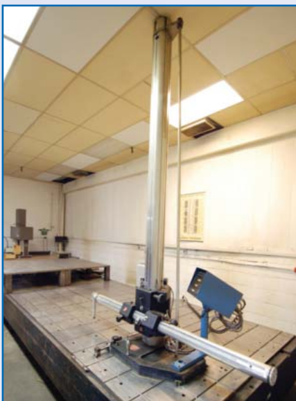
PORTAGE 96A Layout Machine