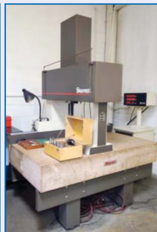
STARRETT RAPID CHECK RCS4028-18 CMM

AIR FEEDS INC. BAF – 5 Air Feeder, S/N 810522, With 12" X 30" Cap.