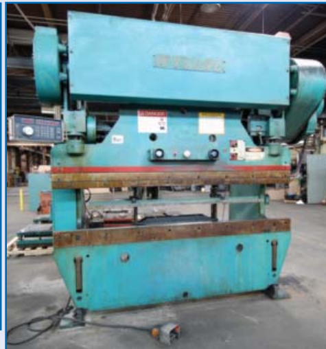
WYSONG 90-6 Press Brake