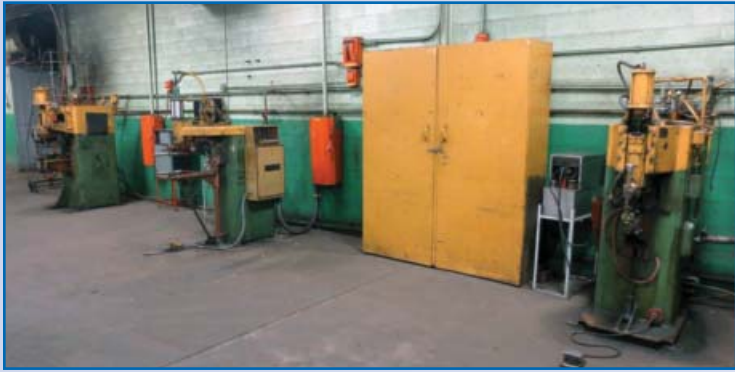
View Of Spot Welders