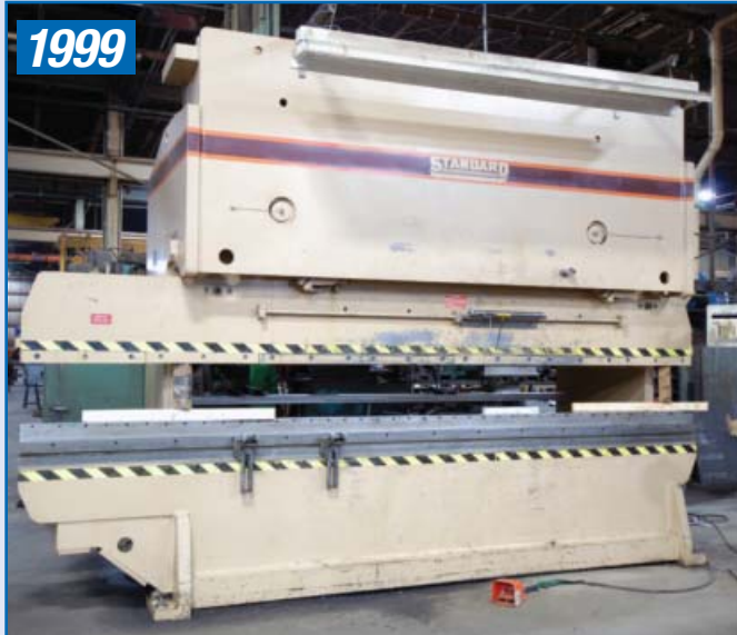
STANDARD AB 250-12 CNC Press Brake