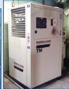
INGERSOLL-RAND TM600 Refrigerated Air Dryer