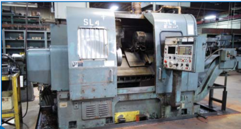
MORI SEIKI SL4 CNC Lathe