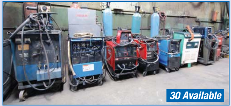
View Of Mig/Tig Welders